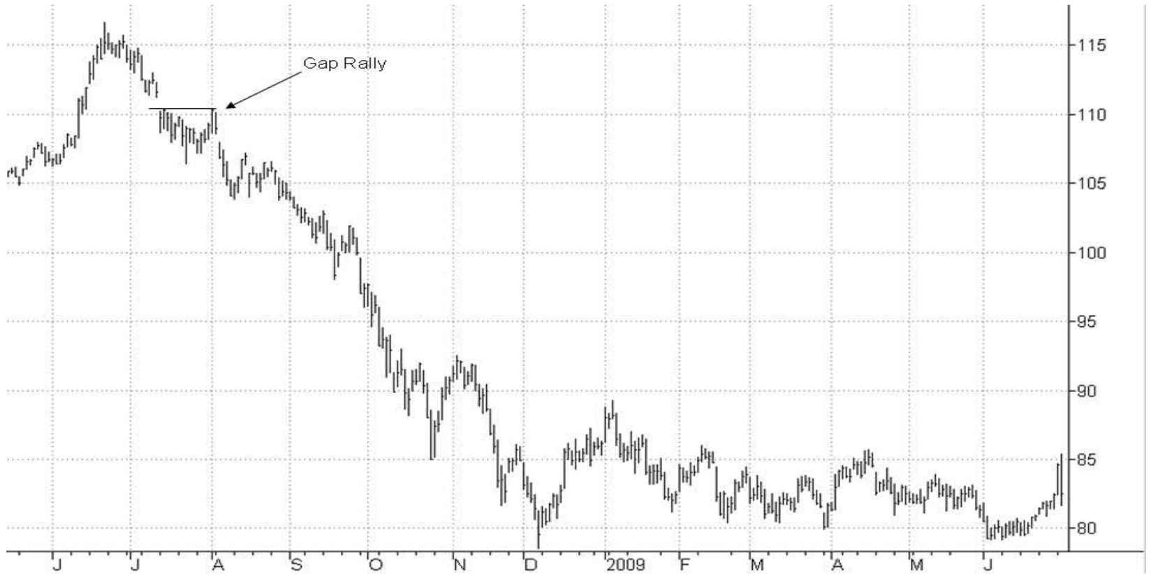
Figure 6. Live Cattle Futures