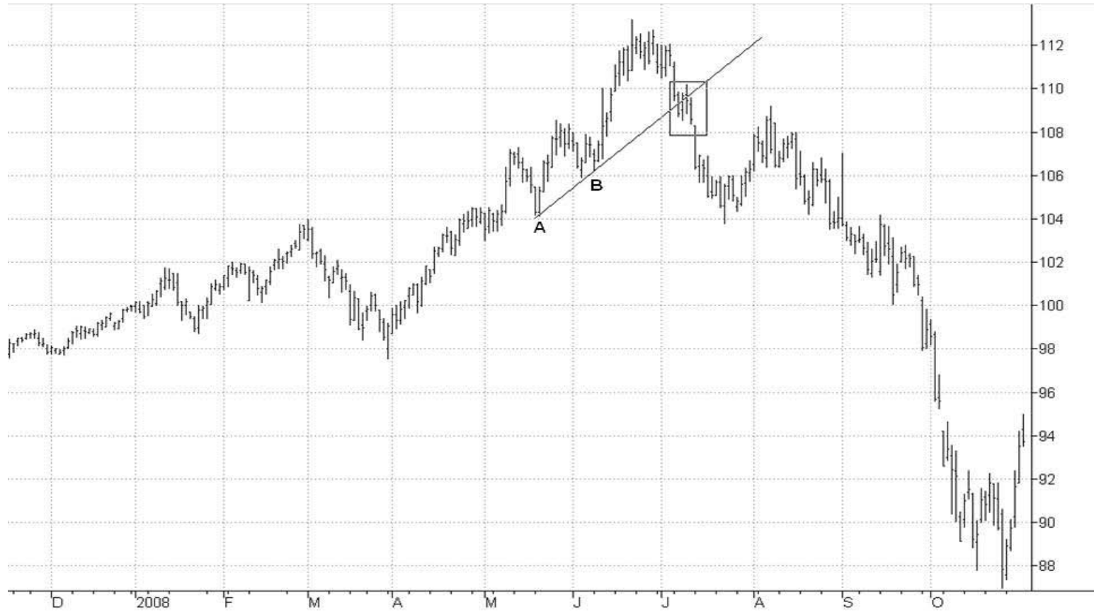
Figure 2. Live Cattle Futures