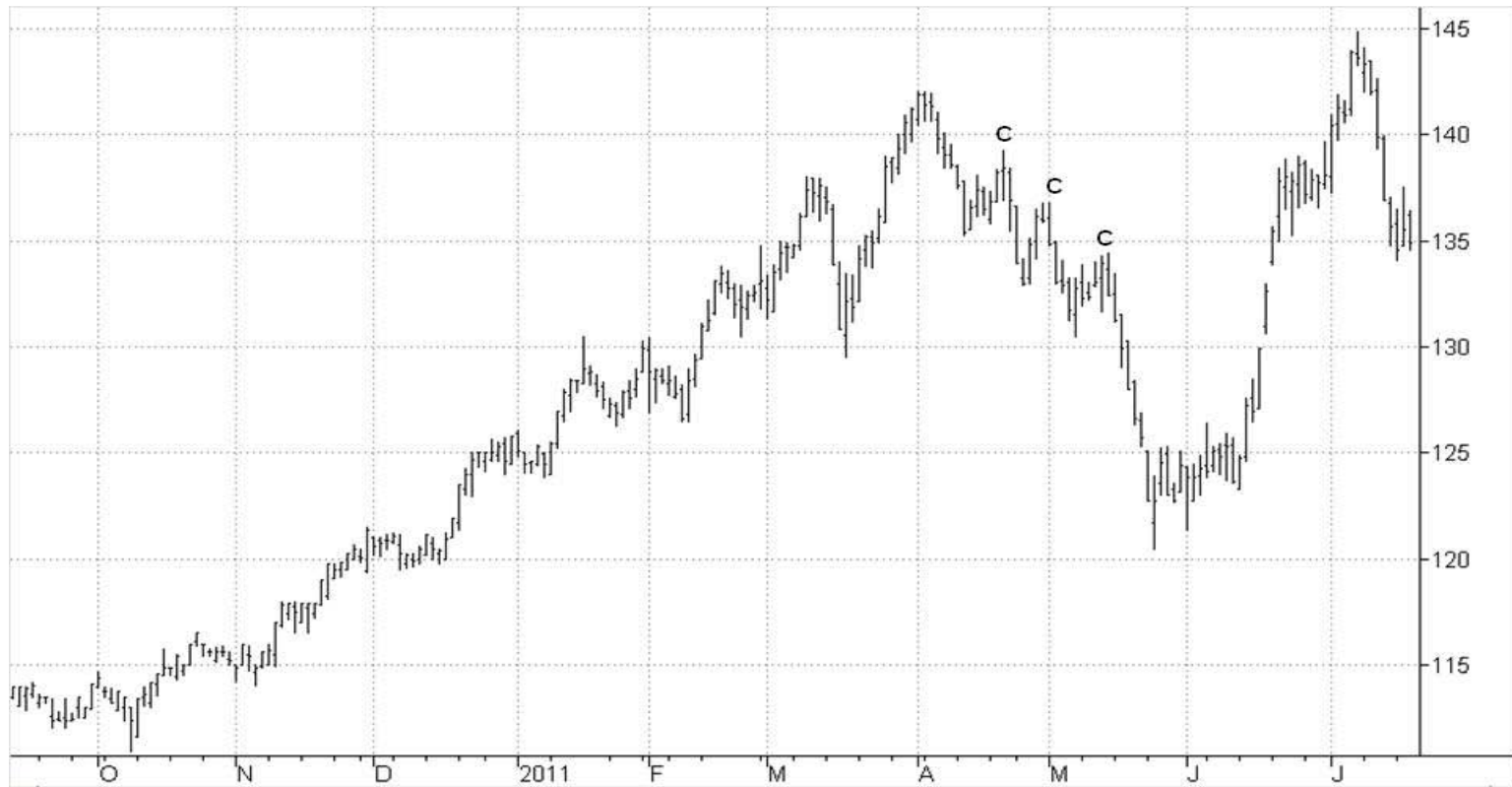
Figure 5. Feeder Cattle Futures