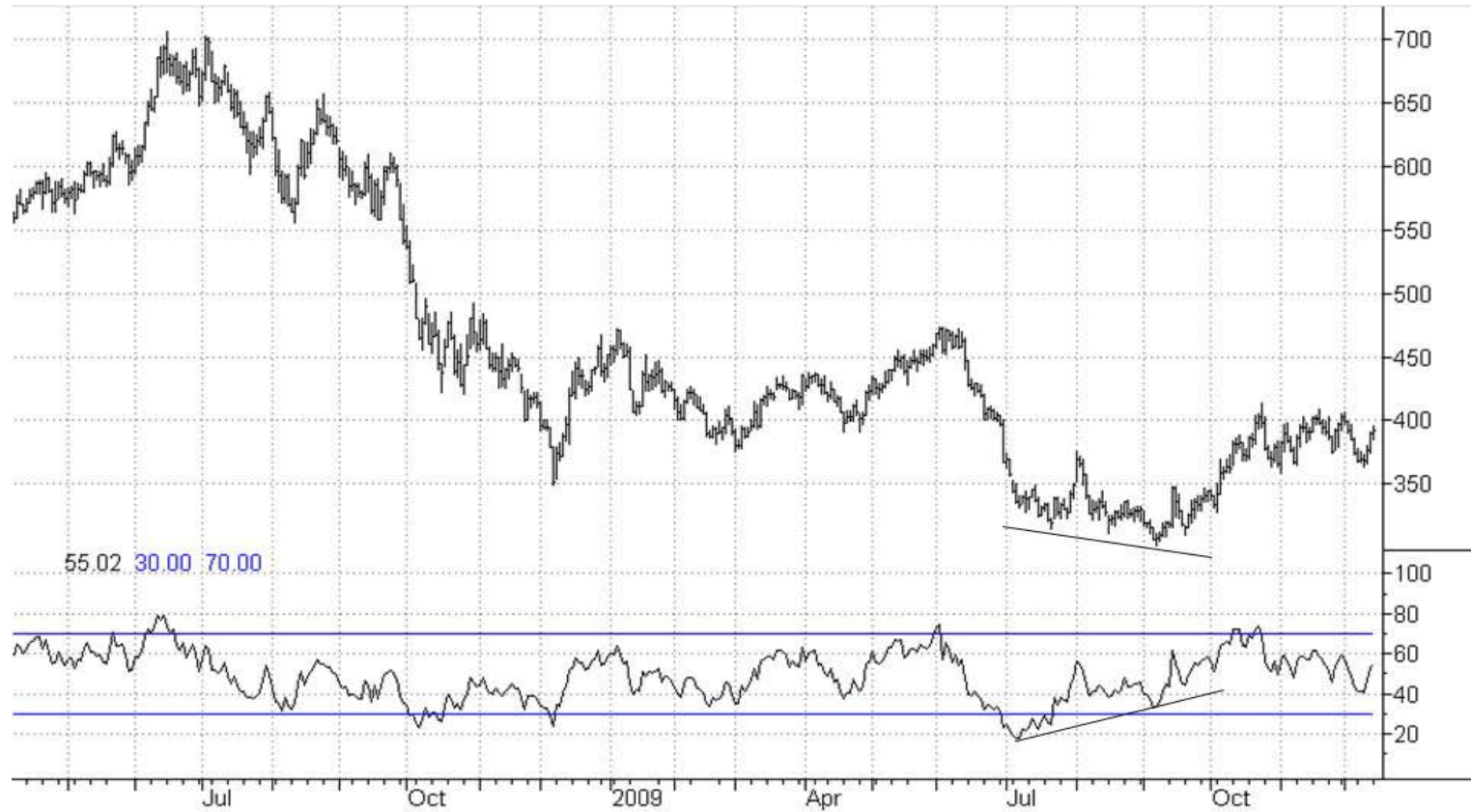
Figure 7. Corn Futures