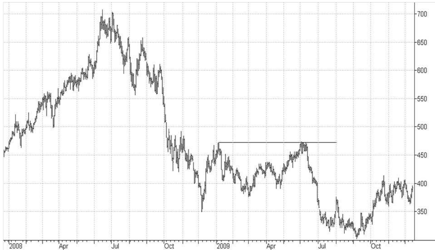
Figure 4. Corn Futures