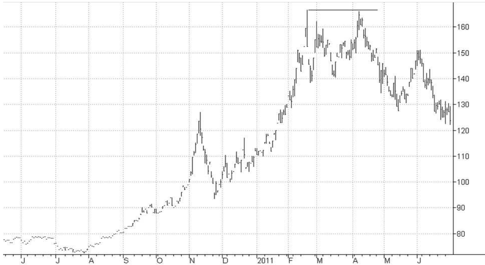
Figure 3. Cotton Futures